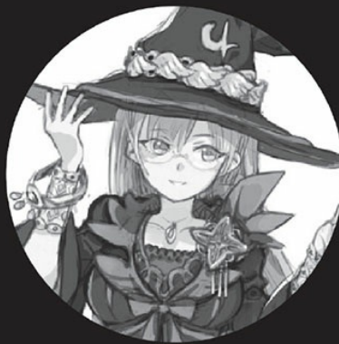
Marie the Witch

The Cursed Belt Princess. Freed from her long-held curse upon meeting Lloyd.