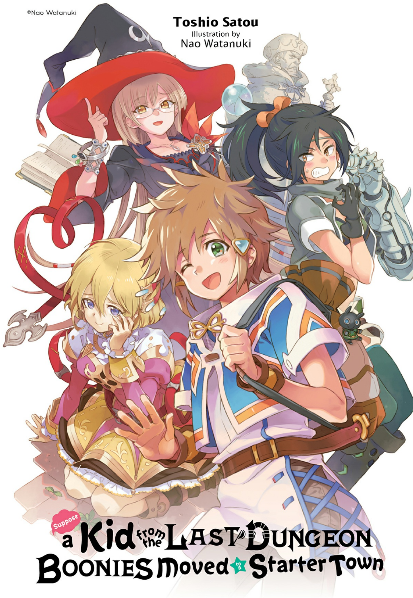
Illustration by Nao Watanuki